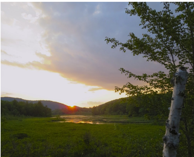
Sunset on Snake River

NH Fish and Game Offices (Concord, Durham, Keene, Lancaster, New Hampton.) Visit www.FishNH.com or call (603) 271-3212 or call NH Department of Environmental Services (603) 271-2047.