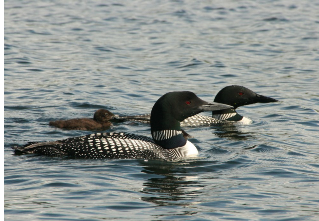
Loon Family on Waukewan, Summer 2014

around loons and loon chicks. If fishing, use the “Reel in Around Loons” rule to prevent a loon from getting caught in your line or swallowing a hook.